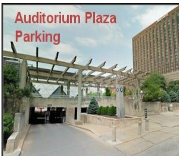
Auditorium Plaza Parking

PARKING: We have arranged for a NAFA special event parking in the “ Auditorium Plaza Garage ” at 1220 Wyandotte between 12th & 13th Streets and between Central & Wyandotte. Entrances to the garage are located on Central and Wyandotte streets. We will distribute validation slips at the business meeting. Please note, we are unable to validate Marriott garage parking.